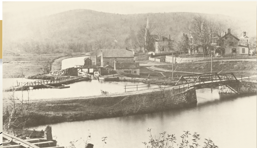
This historic view, taken from the Sussex Branch Railroad ore dock, shows Lock 2 West and Smith's store and blacksmith shop in the center of the picture with old Waterloo Road and the Smiths' homes on the right.

CANAL SOCIETY OF NEW JERSEY Website: canalsocietynj.org E-Mail: canals@canalsocietynj.org